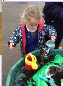
5 th December World Soil Day Early Years planted bulbs!